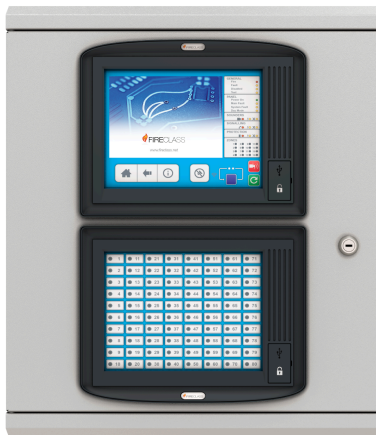
Figure 1: FC708D