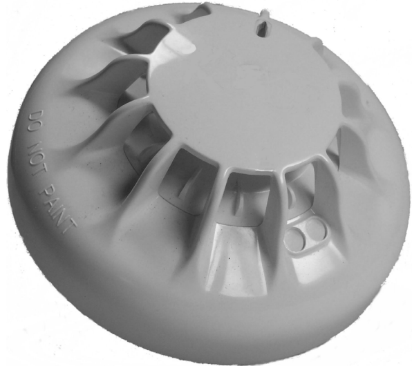
Fig. 1: Dimensions